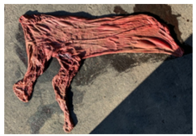
The Neonatal Foal – is my foal normal?

The placenta should be passed within a couple of hours of foaling. It is a good idea to keep the placenta in a bucket for your veterinarian to assess the following day. He or she will examine the placenta to make sure it is complete. Retention of the foetal membranes is a serious, potentially life-threatening, problem and it is important to never skip this step.