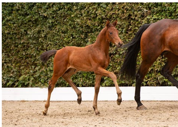
Franziskus x Canterbury