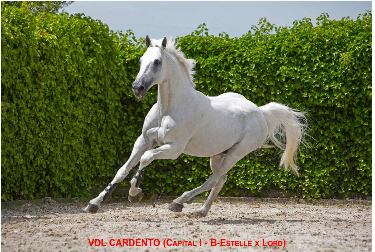
VDL CARDENTO (CAPITAL I - B-ESTELLE X LORD)