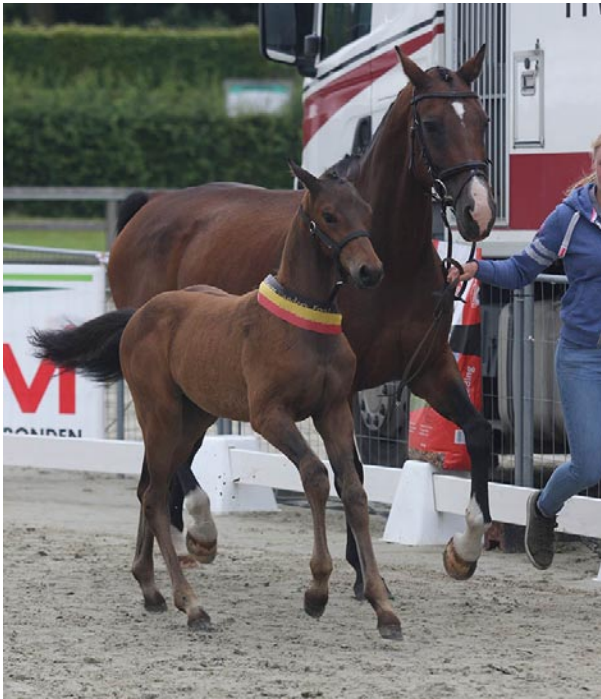
Vive La Vie van de Falsenhoeve (H-Ekwador) with her dam Thunder of the Star Ranch