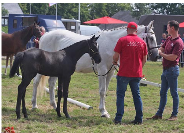
Vaysall van het Weyenshof

Valentia van Koekshof (El Barone III Z - Goldtender van Koekshof x Quickfeuer van Koekshof, BWP dam line 20), bred by Jaak Evens, was the winner in the series for younger female showjumping foals, with van de Vijver once again providing the commentary; "Valentia is a strongly muscled foal that also impressed with strong movements. The foal has a super canter." ■