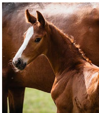
Follow him Schonweide x Lauries Crusador xx

Every horse I saw was worth a chance. To be truthful I would not use all of them as broodmares in my stud. All our broodmares are fourth or fifth generation of mares granted the State Praemie. I have to be 100% sure of a mare I want to use in breeding. We inseminate only three-year-old mares for their development. We want to see how they behave as mothers. Only the elite breeding material can meet our expectations. If there is some doubt about the quality of a mare, she’s foaled once and then we test her in sport. And