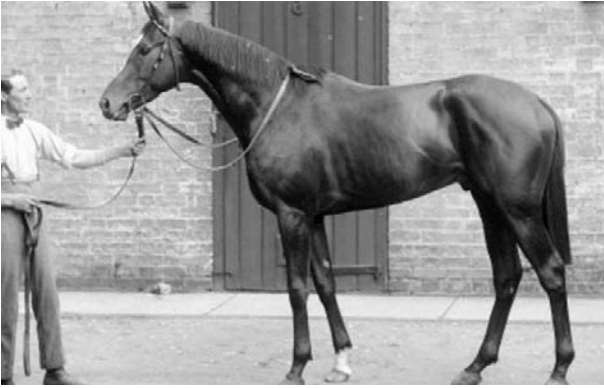
Blandford xx (1919-1935) line bred in the pedigree of Merlina xx, dam of Captain Clover