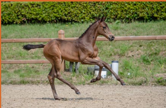
#11 Reaction (Chacco-Blue x Heartbreaker)

A brand-new collection of 13 extremely interesting jumping foals will be auctioned online August 11. This same day the finals of the Blom Cup take place, which will be held at the location of Tops International in Valkenswaard. All foals are very attractively bred out of proven damlines, exactly what is asked for in the modern jumping sport