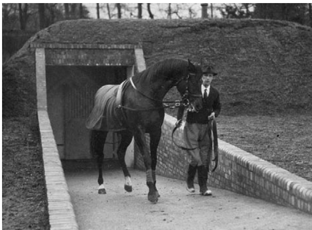
Legendary sire Nearco xx (1935-1957)

Captain Clover's dam Merlina xx was a 1975 16hh