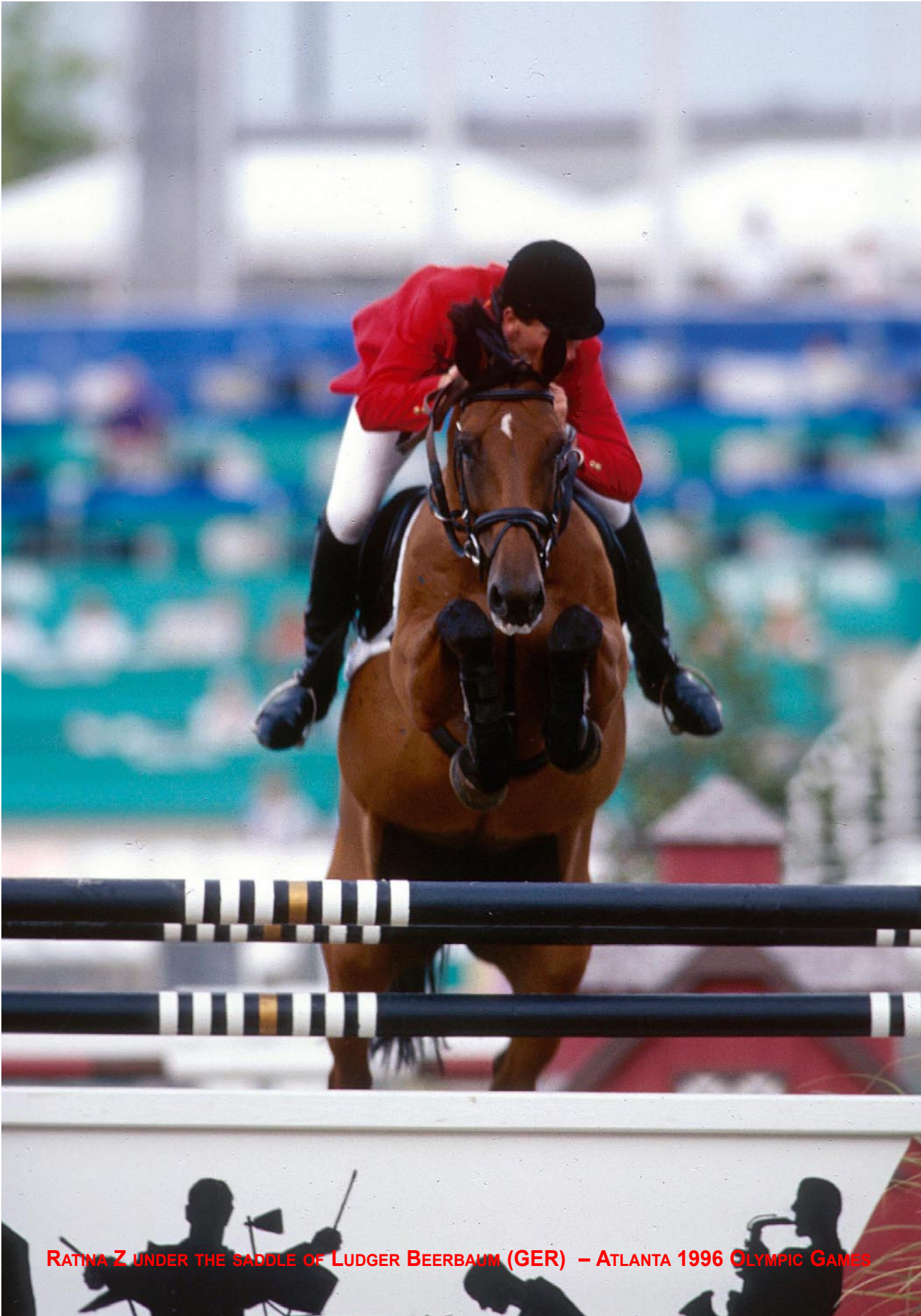
RATINA Z UNDER THE SADDLE OF LUDGER BEERBAUM (GER) – ATLANTA 1996 OLYMPIC GAMES