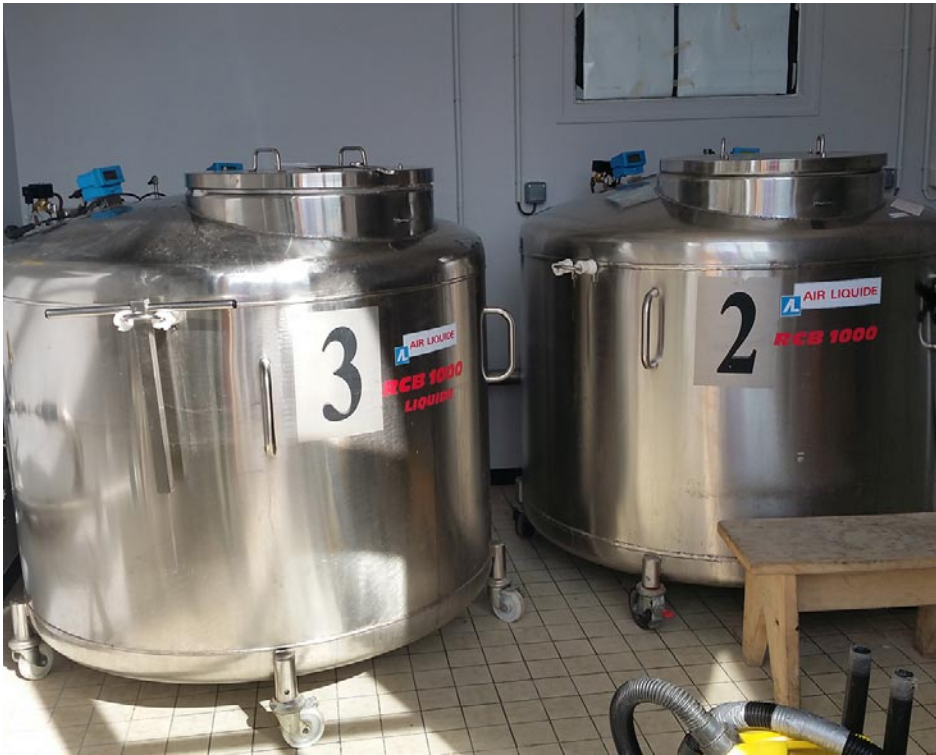
Nitrogen storage tanks

during his sporting career. These stallion keepers will endure to the end of their stallion's breeding career and then either cease business or turn professional.