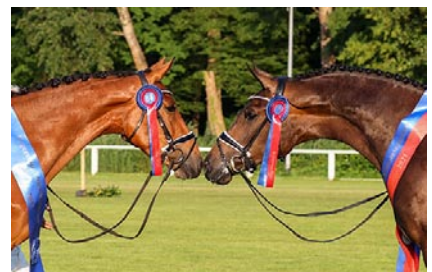
The champion mares (l-r) Tiramisu and Faraglioni