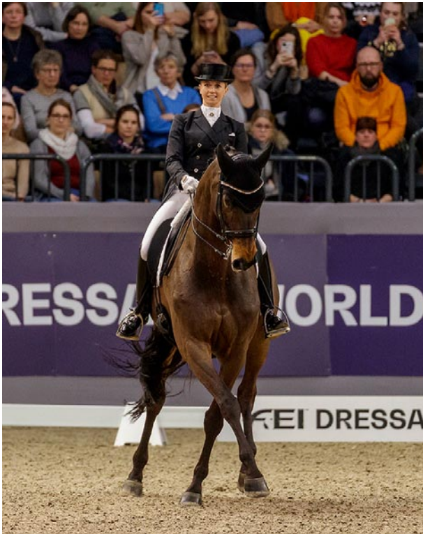
TSF Dalera BB ridden by Jessica von Bredow-Werndl