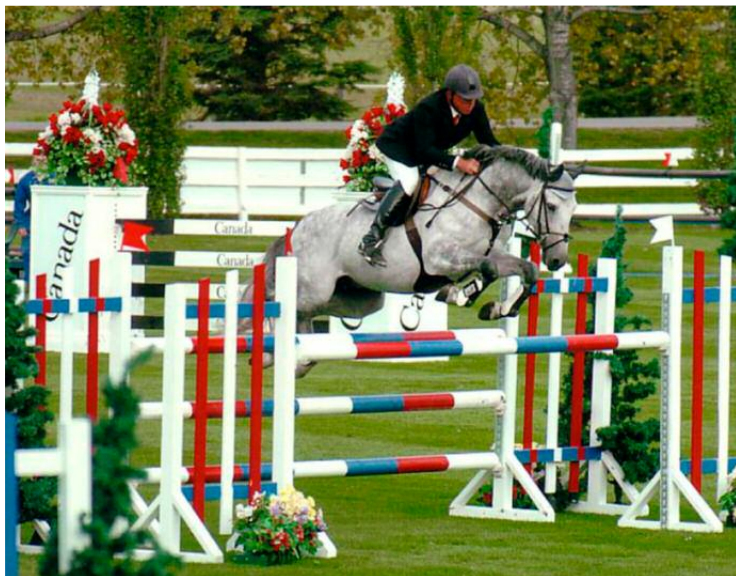
Carthago Sun I, competing at Spruce Meadows, Calgary

Clearly the longer term impact of this stallion will be through his daughters. With a significant number of registered daughters – many already entered and active in the breeding books – the future effect will be long lasting. The CWHBA offers condolences and thanks to JES Breeding Farm, for the outstanding contribution Carthago Sun I has made to the Canadian breeding program. ■