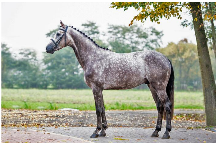
Liszkowo Horse Stud main stallion Fabregas S (MJT Nevados S - Fabreggia S x Redel)