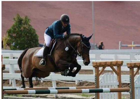
Chile (Carthago Sun I - Cicada x Ferro)