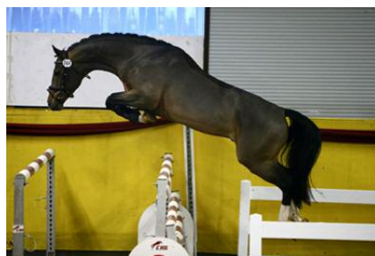
Coupiko