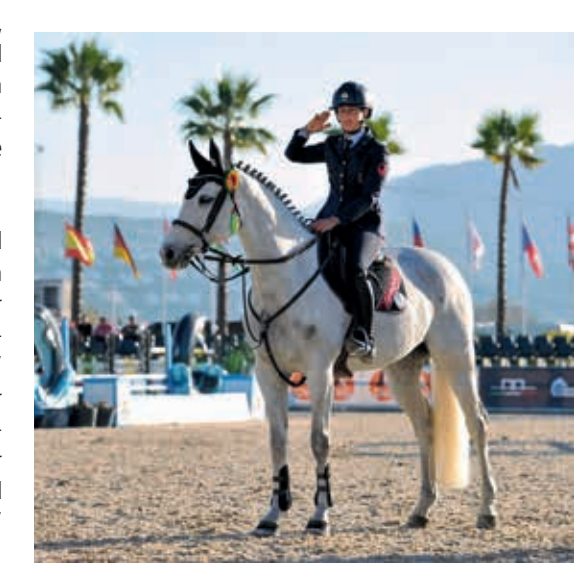
Hannoveraner – Success all over the world: There are breeders and friends of the Hannoveraner all over the world.

Breeders in Australia, Great Britain, New Zealand and the USA are organised in daughter associations in their respective country. These associations keep their own studbooks in close cooperation with the Hannoveraner Verband. Together with the nine breeders' clubs, they form the district association Hannoveraner International. The president of Hannoveraner International is a member of the board of the Hannoveraner Verband. Depending on size, each association and club is entitled to send delegates to the delegates' assembly of the German Hannoveraner Verband.