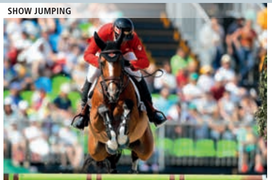
Fine Lady by Forsyth/Drosselklang II winner of the Bronze Medal at the Olympic Games in Rio de Janeiro with Canadian rider Eric Lamaze.