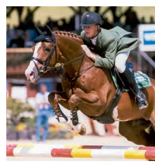
Famous For Pleasure: Influential sire in the worldwide breeding of jumping horses