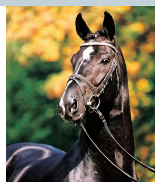
Famous De Niro: Leading sire in the global breeding of Dressage horses