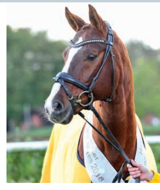
Two leading Rhenish sires: Belissimo M by Beltain /Romadour II (on the top) and Florestan I by Fidelio/Rheingold (on the bottom)

The regulations of the Rhenish studbook differ from the Hannoveraner studbook rules with regard to the requirements for mares and stallions to be entered in the respective studbook. The Rhenish studbook is more liberal and accepts mares and stallions of most major studbooks whereas the Hannoveraner studbook as one of the world's leading studbooks is more selective. Therefore, cases will occur where it will be possible to register foals with the Rhenish studbook, which are by stallions, who are not approved for the Hannoveraner breeding programme.