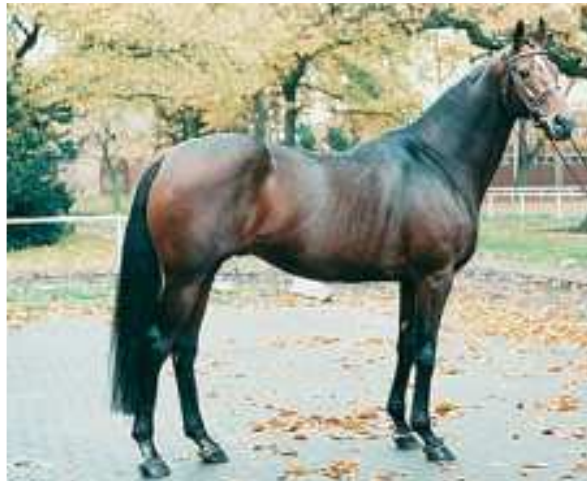
Lauries Crusador xx